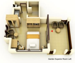
Garden Superior Room Left