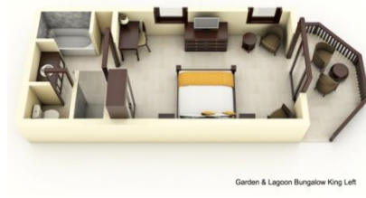
Garden & Lagoon Bungalow King Left