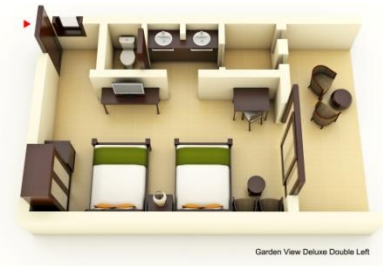
Garden View Deluxe Double Left