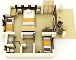
Garden Superior Family Room Right

Bedding: Rooms with either 1 queen bed or 1 queen + 2 single beds or x2 double beds or 1 king, or 1 queen bed with 1 single bed.