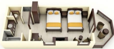
Garden & Lagoon Bungalow Double Right

Location: Surrounded by manicured gardens.